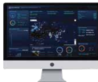
Smart PV Monitoring Platform