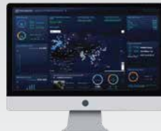
Smart PV Monitoring Platform